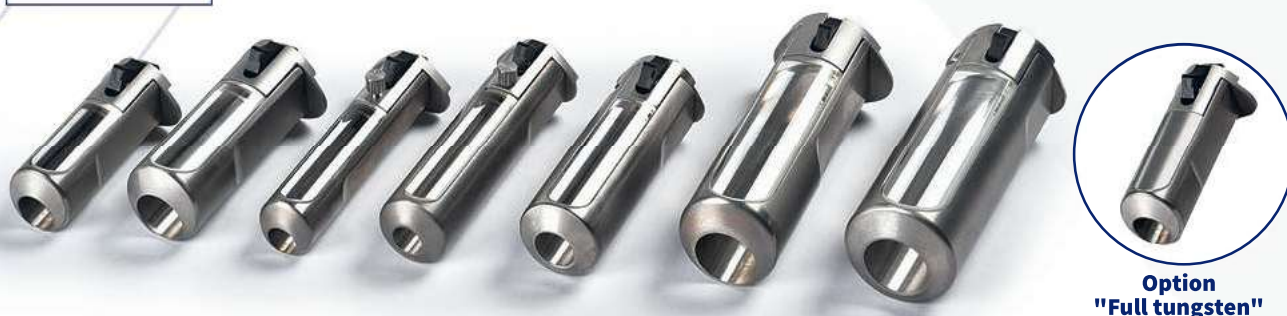
Option "Full tungsten"

Easyview syringe shields are available in a wide and complete range of sizes and shielding (from 2 to 7 mm of tungsten) to offer users an ergonomic and protective solution that is essential during the preparation, transfer and injection of all-energy radio-pharmaceutical doses for SPECT and PET activities. Regardless of the radioisotope to be handled: ^{99m}\text{Tc} , ^{111}\text{In} , ^{123}\text{I} , ^{177}\text{Lu} , ^{201}\text{Tl} , ^{131}\text{I} , ^{18}\text{F} , ^{68}\text{Ga} and the required administration method: direct injection to